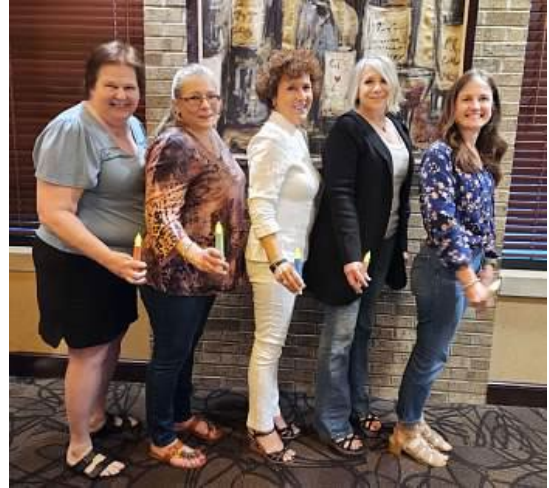
HWC Installation Dinner, May 18 TH 2024 at the Galaxy Restaurant