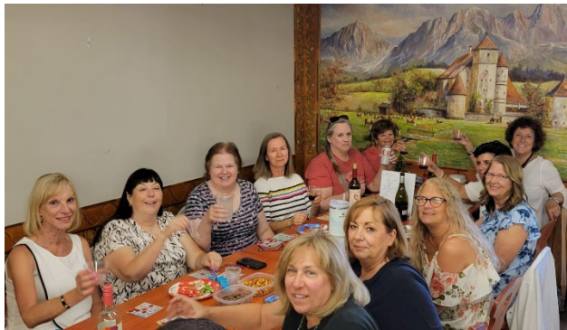
Tangled Vine Christmas in July Bingo & Wine Tasting