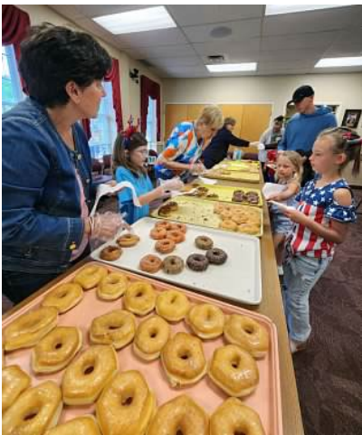
Memorial Day Parade – Walkers and Donuts galore!