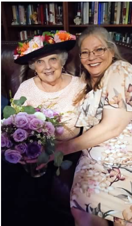
1 ST Annual Kentucky Derby Party