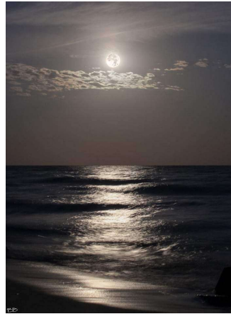
And Moon over water!

A few pics from our last meeting at the Medina Library: