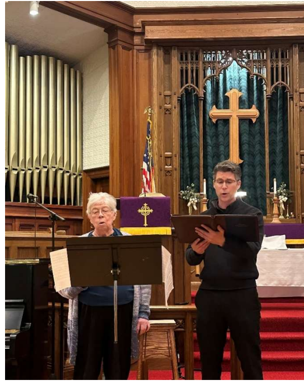
April 2 nd - Maundy Thursday Service at 6:30pm.