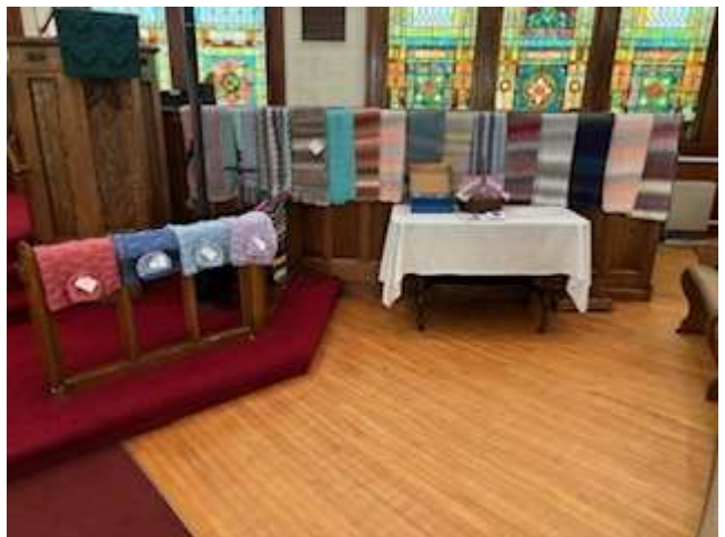
September 15, 2024 – Pastor Rich dedicated many prayer shawls, baby blanket/hat sets and pocket prayer shawls during our Worship Service.