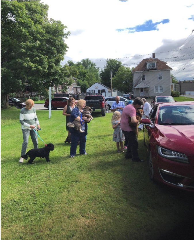
Sunday, August 20 th - "Blessing of the Animals" during Worship Service