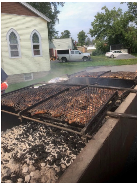
Rack of chicken (yummy)!