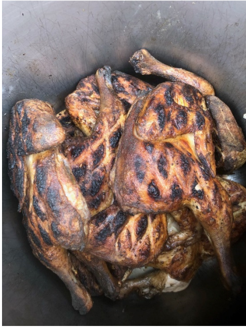
Chicken sure looks good!