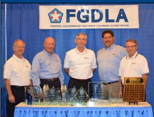
Display of our awards at a previous conference with a few of our board members