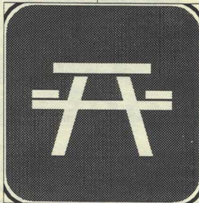
A revitalization of Washington Park is being planned.

the neighborhood remains high by continued efforts to remind everyone of our Neighborhood Guidelines.