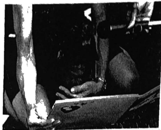
Sprout puts his soul into singing the Oldies and takes a prize at last year's Washington Bark Dog Day.

The market features fresh, flavorful produce, unique artisan crafts, and entertainment – all from within a few miles of home. Scope out the market's produce vendors this year. Unlike area grocery stores that import produce from across the country and around the world, all of the market's produce vendors come from the area and bring the freshest, most flavorful produce for Westsiders. By purchasing your produce at the market, you will be supporting your neighbors and the community, and ensuring healthy, delicious meals for you and your family without paying for grocery store packaging and shipping. In addition to fresh produce, the Senior Center will host vendors like Milwaukee Pie