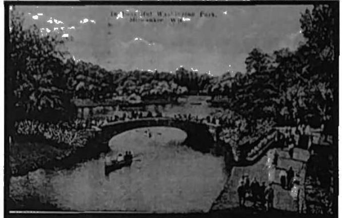
An old postcard featuring Washington Park

Weekly horse races, a man made lagoon, row-boats and an observation deck to view the deer, antelope and black bears housed at the park, ensured that Washington Park was very popular with residents of Milwaukee.