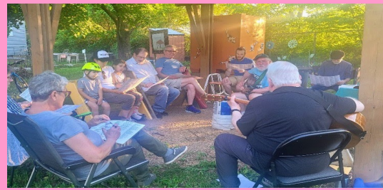
Planning Meeting (left) and 2023 Executed art Boxes (below).