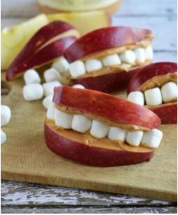
2. Apple slices, peanut butter and miniature marshmallow