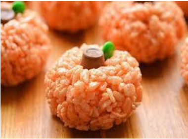
3. These Rice Krispie Treat Pumpkins are so cute and they're really easy to make!