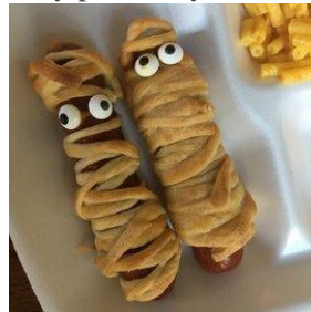
Mummy hotdogs Original recipe yields 8 servings

1/4 cup orange juice 3/4 cup 7-Up 2 TBSP grenadine syrup. Add whipped cream and cherries for garnish or a scoop of vanilla ice cream put in first. Add a few ice cubes to your glass. Add in the ingredients in the order listed above. First add the orange juice, then the 7-Up. Next add the grenadine and allow it to sink to the bottom. This will give the drink a layered look! Add a little whipped cream and a cherry on top and serve to your favorite guests. Or just Sprite or white soda, ice, Grenadine, Syringe Pour Sprite/white soda over ice. Add Grenadine-filled syringe. You can find these "syringes" which are actually medicine droppers available at pretty much any pharmacy or online.