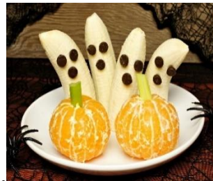
1. Bananas chocolate chips Oranges & celery sticks