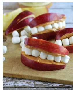
2. Apple slices, peanut butter and miniature marshmallow

3. Q-TIP HANDPRINT SKELETONS What kid doesn't love getting all up in some paint? Have them paint their hand and wrist white, press it on to black paper, and then press on Q-