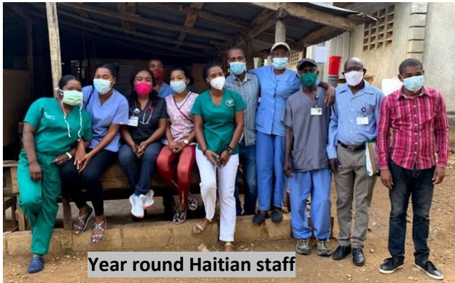
Year round Haitian staff

Although we have four nurses and six health workers employed year round to provide a basic medical clinic and run our malnutrition, hypertension, and referral programs, there is still no physician serving our community. We are currently talking to Haitian physicians about the possibility of working full-time in our clinic.