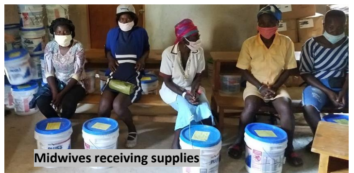
Midwives receiving supplies