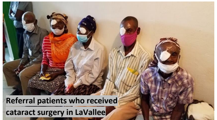
Referral patients who received cataract surgery in LaVallee