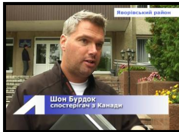
After visiting DEC #122 (Yaroriv), Team 13 granted an interview request from Lviv TV, to discuss the procedures involved in the PEC lottery selection. Nothing contentious or unusual was asked or answered, (and the Mission Canada folder was held high-up, in camera's view!) Team 13 members privately expressed concerns regarding the length of the on-air interviewer's dress. (The boots, themselves, were not discussed). Full story found at: http://www.youtube.com/watch?v=zv-iSFQMiiU&feature=plcp