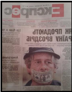
A recent front-page article in the Lviv Express highlighted the problem of vote-buying, but the topic of suppression has not yet been identified.