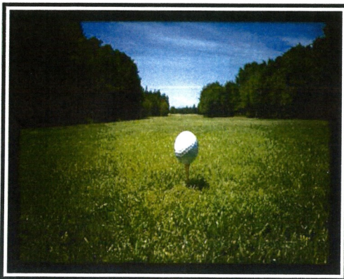
Come Join your Brother's & Sister's In Recovery for this Fun Sober Event