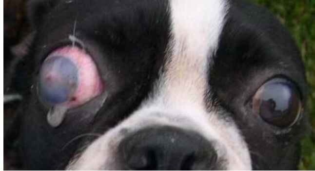
Puppy mill breeding dog in desperate need of medical care xii

they were. There were dogs with many infected cuts and wounds. There was just no end to the horrors I saw that day and the stench.” xi