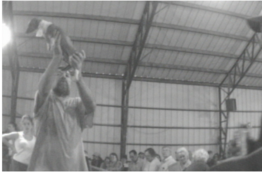
Puppy mill auction*

To illustrate the point, here is one rescuer's memory of attending an auction: