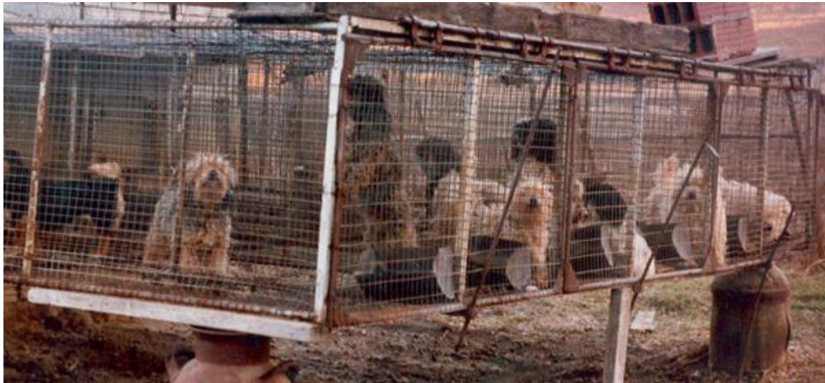
A typical puppy mill ii

The term “puppy mill” is commonly used to describe large, commercial dog breeding facilities with subpar standards of care. After a drought following WWI, farmers were in need of a cash “crop,” so they stuck dogs into their chicken coops and rabbit hutches and began breeding them for money. The deplorable conditions in which the dogs lived were the impetus for the Animal Welfare Act (discussed below). i