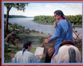
Frontiers and Empires