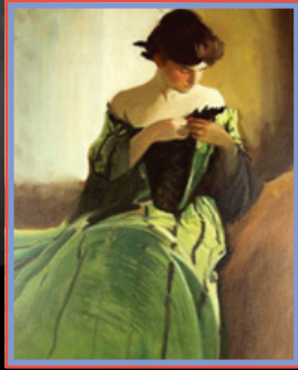
John White Alexander Study in Black and Green