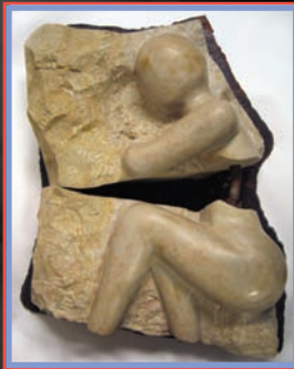
Best of Show Trevor Camp Stone Sculpture

Opening Reception January 27, 2008, 2:00-4:00PM Closing February 24, 2008