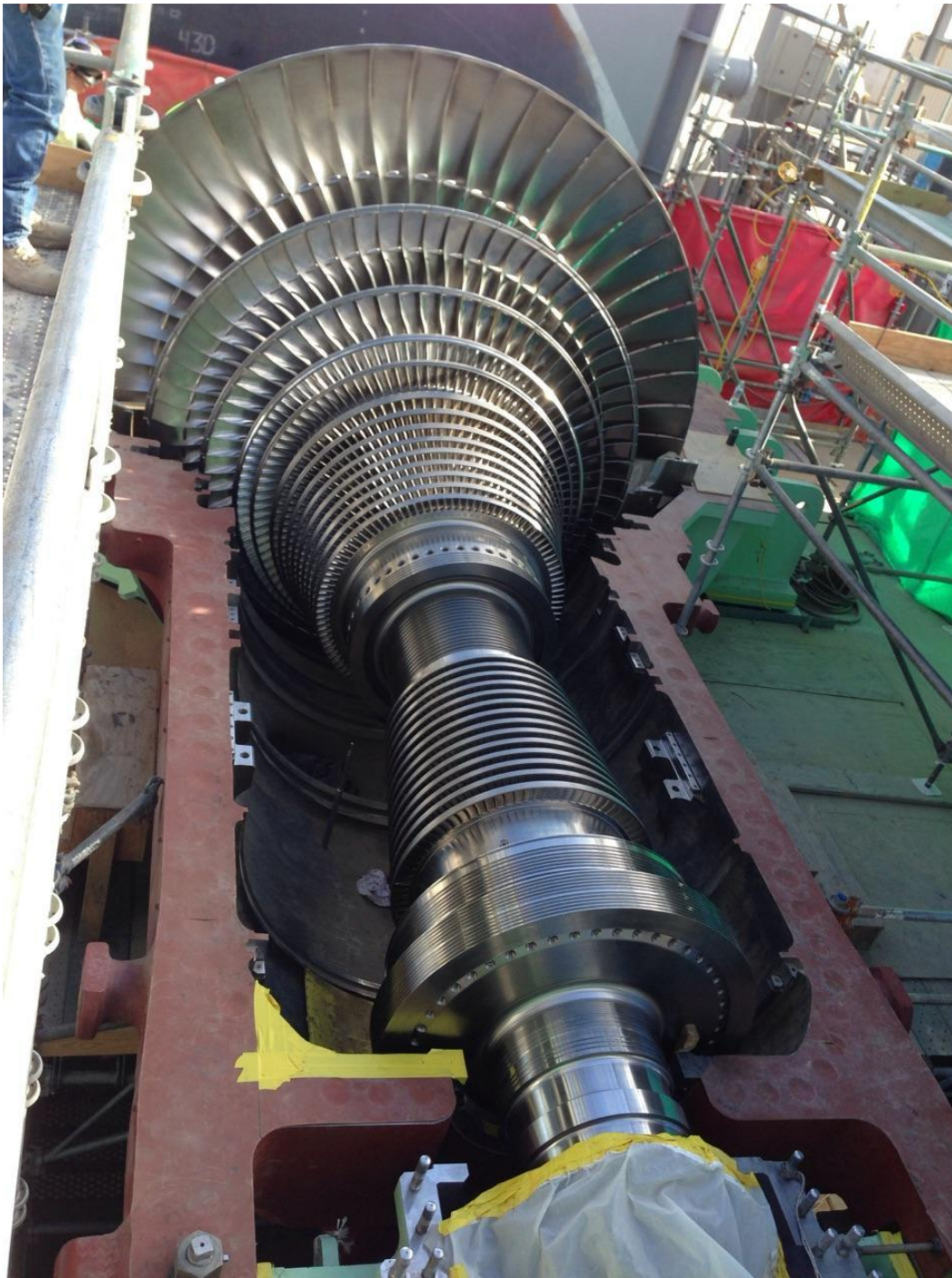
Figure: CardiCoGen turbine seated in final staging position for alignment and inspection.