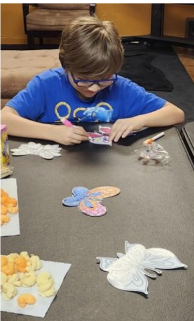
Youth group stained glass class