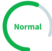
Glucose Response To Cardio