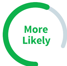
Intrinsic Motivation To Exercise