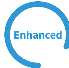
Insulin Sensitivity Response To Cardio