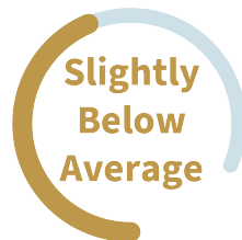
Impulse Control And Taste Preference With Aging