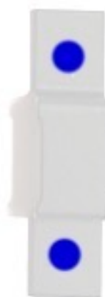
Surface- mounting Door Strike.