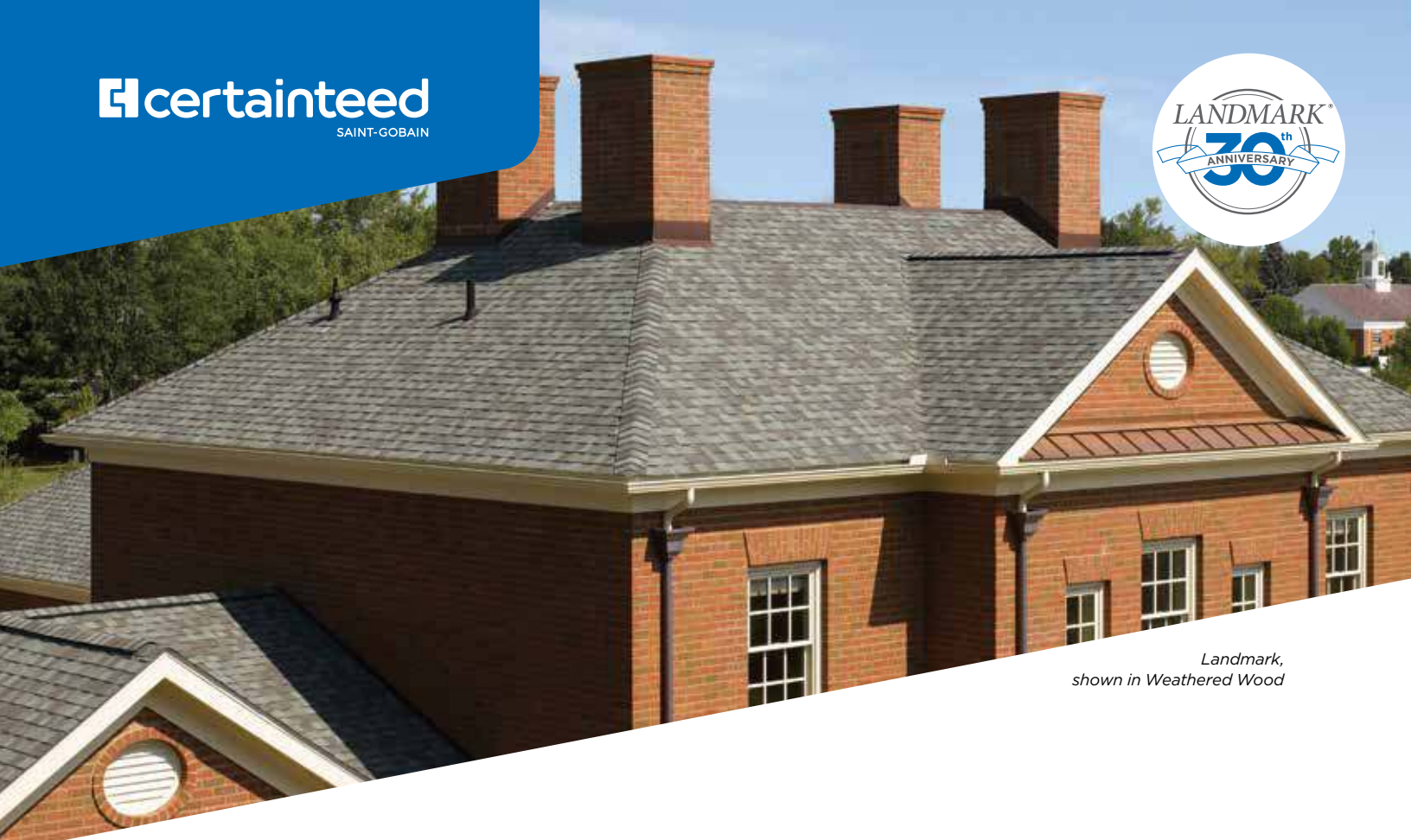
Landmark, shown in Weathered Wood