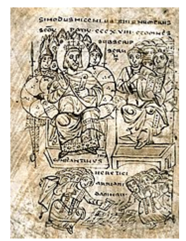
The synod of Nicaea, Constantine and the condemnation and burning of Arian books, illustration from a northern Italian compendium of <u>canon law</u>, <u>c.</u> 825

The Arian discussions and debates at the Council extended from about 20 May through about 19 June.<sup>[54]</sup> According to legendary accounts, debate became so heated that at one point, Arius was struck in the face by