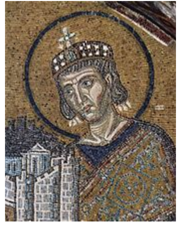
Constantine the Great summoned the bishops of the Christian Church to Nicaea to address divisions in the Church (mosaic in <u>Hagia Sophia</u>, Constantinople (Istanbul), c. 1000).

Delegates came from every region of the Roman Empire and from the Christian churches extant within the <u>Sassanid Empire</u>.<sup>[33]</sup> The participating bishops were given free travel to and from their <u>episcopal</u> sees to the Council, as well as lodging. These bishops did not travel alone; each one had permission to bring with him two priests and three <u>deacons</u>, so the total number of attendees could have been above 1,800. Eusebius speaks of an almost innumerable host of accompanying priests, deacons,