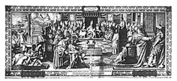
A fresco depicting the First Council of Nicaea at the Vatican's Sixtine Salon

In the short-term, the Council did not completely solve the problems it was convened to discuss, and a period of conflict and upheaval continued for some time. Constantine was succeeded by two Arian emperors in the Eastern Empire: his son, <u>Constantius II</u>, and <u>Valens</u>. Valens could not resolve the outstanding ecclesiastical issues and unsuccessfully confronted <u>St. Basil</u> over the Nicene Creed.<sup>[81]</sup>