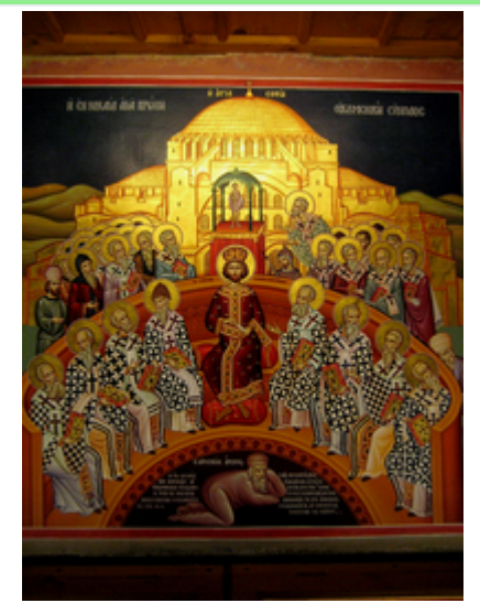
The Council of Nicaea, with Arius depicted as defeated by the council, lying under the feet of Emperor Constantine.