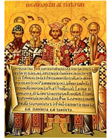
Icon depicting the Emperor Constantine and the bishops of the First Council of Nicaea (325) holding the Niceno–Constantinopolitan Creed of 381