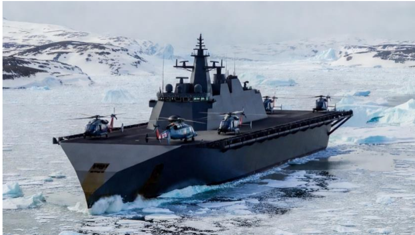
AI conceptualized Canadian Arctic Amphibious Ship.

Today, the strategic landscape has shifted dramatically. With Arctic Sea routes becoming more navigable and foreign powers like Russia and China increasing their presence in the region, Canada faces heightened pressure to assert sovereignty over its northern waters. The RCN's current fleet, while capable, lacks specialized vessels for sustained operations in ice-covered areas without relying on limited port facilities. Topshee's proposal aims to address this gap by envisioning a ship that can operate independently in harsh polar conditions.