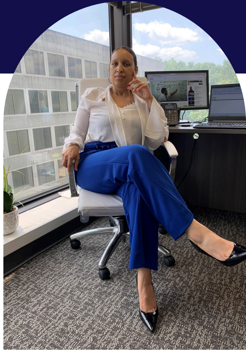
CEO, MDH MORTGAGE