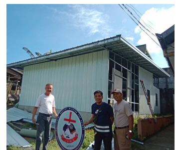
New Church Building for our Church at Dumantay, Batangas City