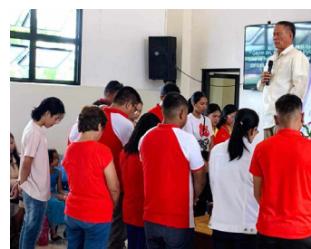
Church Anniversary: 62 professions of faith