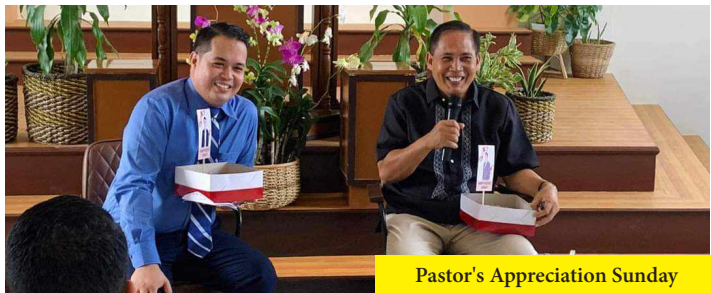
Pastor's Appreciation Sunday

was successful and participated with more than 200 delegates from different churches in Luzon. It was indeed a blessing, as they discovered how to make an impact on our schools, workplaces, and communities with the transforming and transcending light of Christ in us.