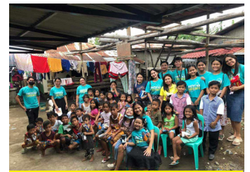
Barangay Wawa Sparks New Center

prayers, that these people will be able to continue and also truly follow God.