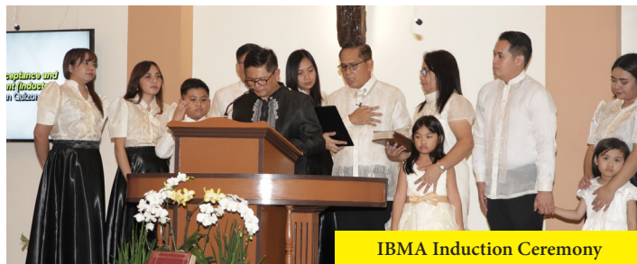
IBMA Induction Ceremony

By December, the church celebrated the Christmas together through worshipping God with singing, feeding of the Word, giving testimonies, giving our thanksgiving offerings for the Lord, and giving of gifts. We also had some fun activities in the afternoon and had eating fellowship after.