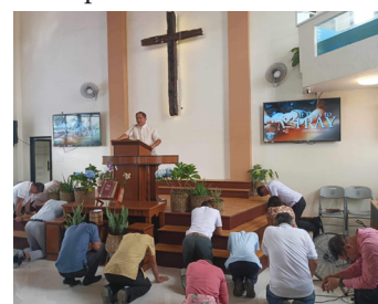
Prayer and Fasting