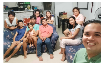
Home Bible study at Reyes family residence.