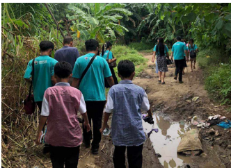
Community Evangelism at Barangay Wawa