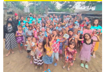
Barangay Cuta Sparks New Center