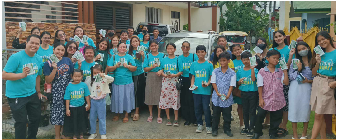
COMMUNITY EVANGELISM. Soulwinning and tracts distribution at our new mission outreach - Wawa and Cuta.

As we continue to thrive for missions, we as church were able to share the gospel to 850 people and distribute tracts to 6532 people for the entire year of 2023 by the grace of God. All praises be unto God.