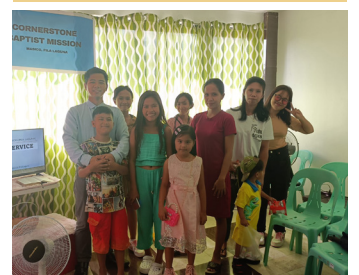
New Mission Church at Pila, Laguna