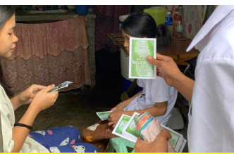
Soulwinning at Barangay Wawa