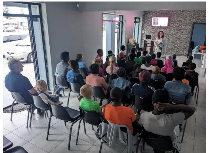
FRIDAY NIGHT YOUTH