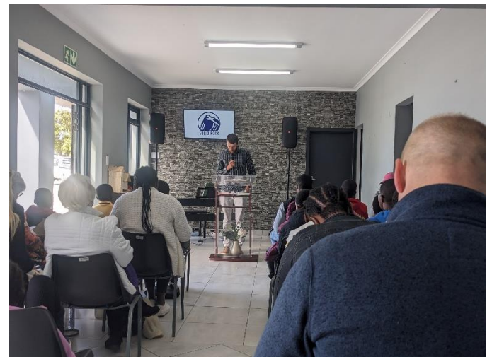
SOLID ROCK BAPTIST CHURCH