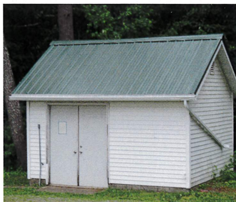
Shed roof and gutters work has been completed!