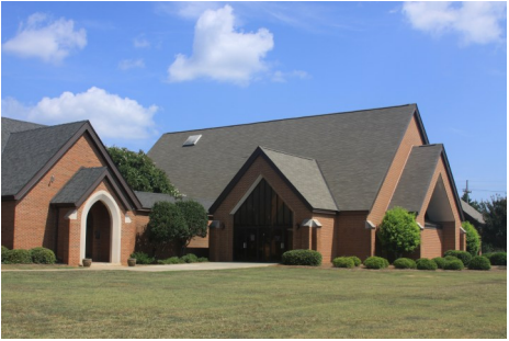
Bypass Campus (BPC)