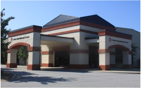
Rivers Street Campus (RSC)