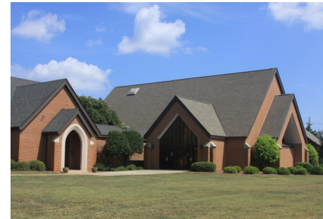
Bypass Campus (BPC)