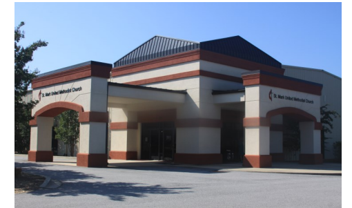
Rivers Street Campus (RSC)