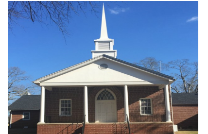
The Coronaca Campus (TCC)