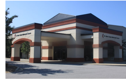
Rivers Street Campus (RSC)