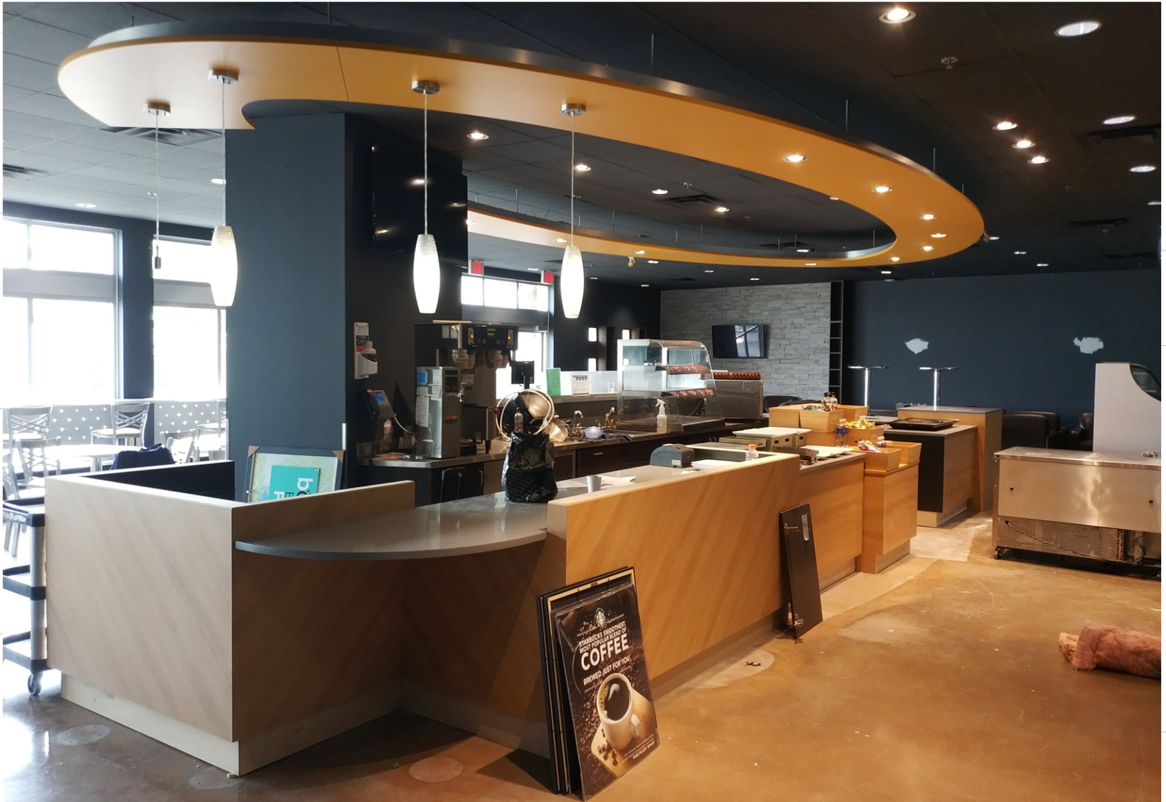
THE RIX - B.C.I.T Service counter & Bar counter