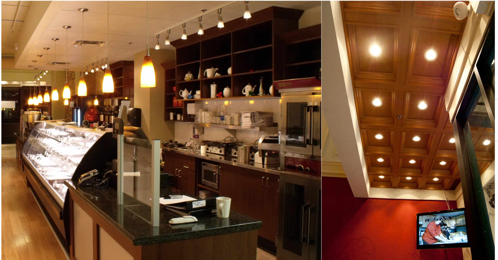
Left - Front Counter & Display Cooler Right - Ceiling