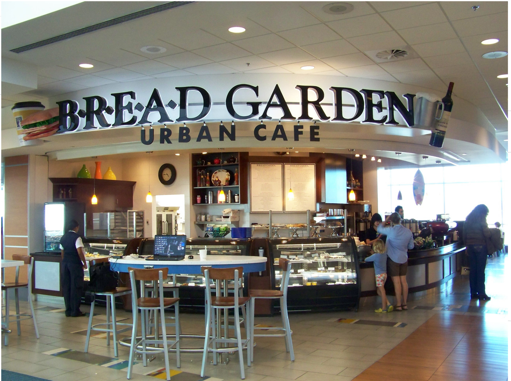
Bread Garden - Urban Cafe