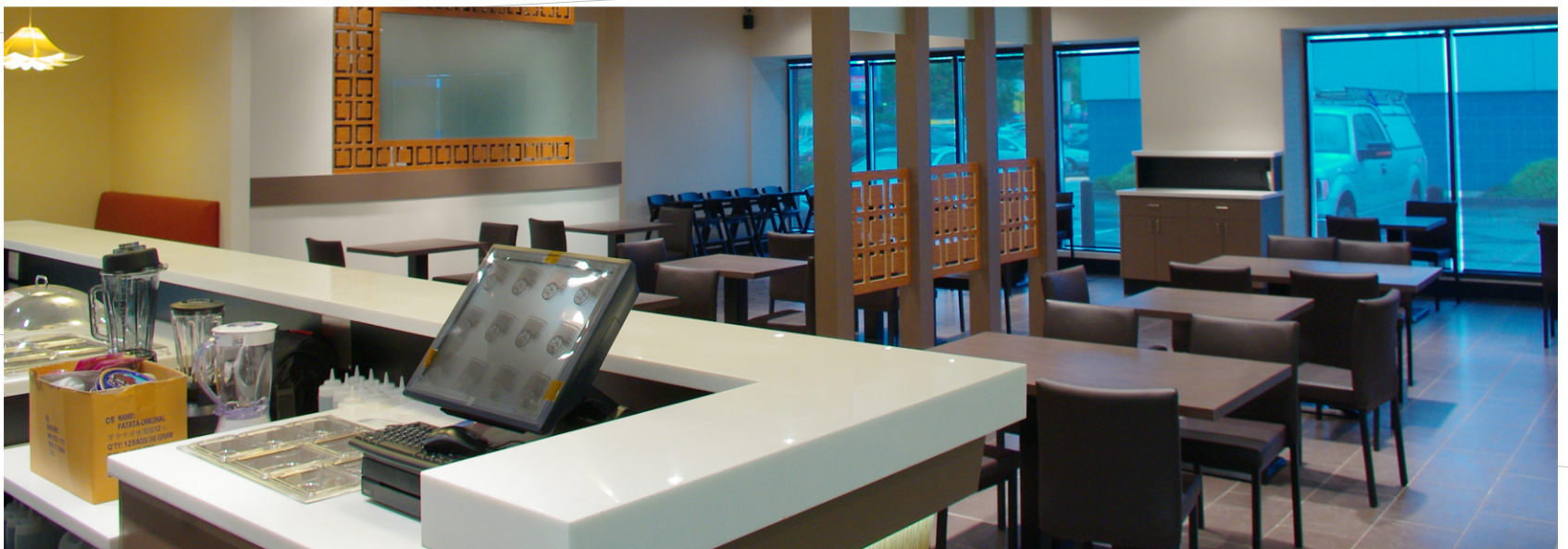
Above - Bar Front Counter Below - Divider & Seating Area