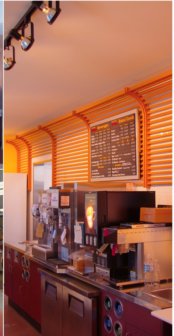
Above - Service Counter Surrey Campus Below - Service Counter Richmond Campus Right - Back Counter Surrey Campus