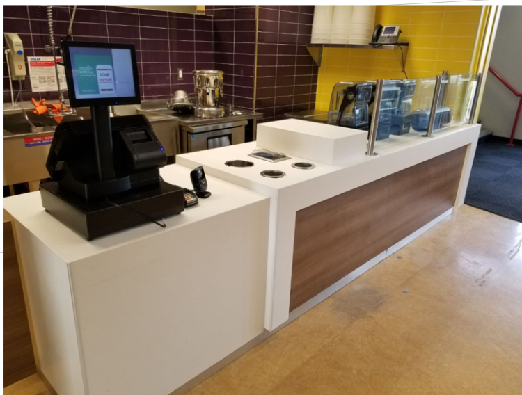
BCIT - Booster Juice Burnaby, BC