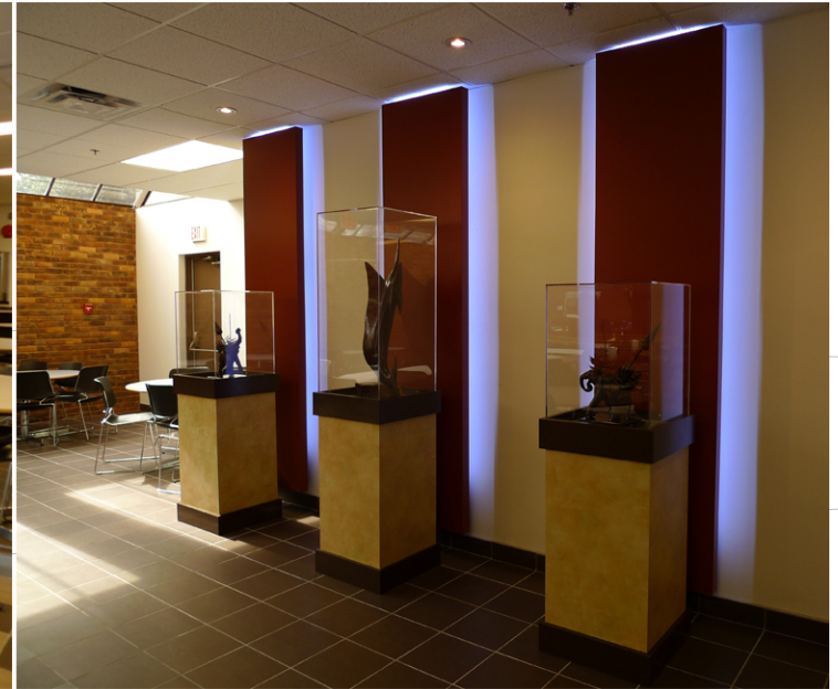
Above Left - Seating Area Above Right - Wall Display Below Right - Self Service & Soup Counter