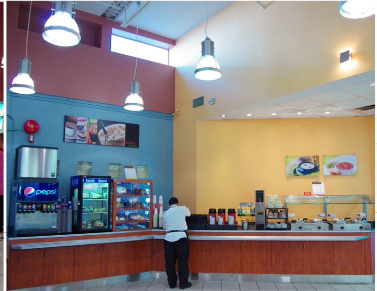
Above Left - Service Counter, Townsquare Above Right - Self-Service Counter, Townsquare Below Right - Service Front Counter, Library