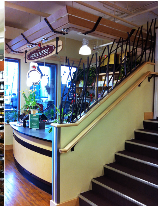
Left - Soup counter Right - Pharmacy customer service