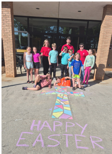
Check out some of the fun we had on game night, April 13, also Palm Sunday, in preparation for Holy Week!