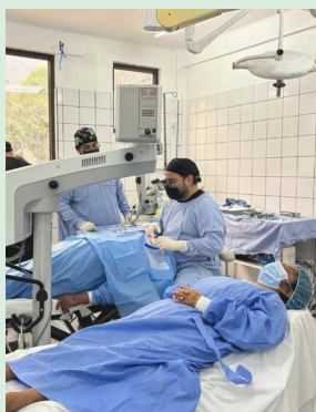
Surgery Center in Hospital Bethesda