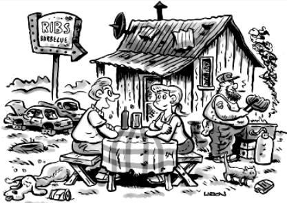
"A place that looks this terrible just has to be fantastic!"