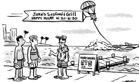
"If you wear the banner it's half price"