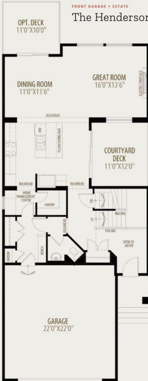
Main Floor 1,035 sq ft