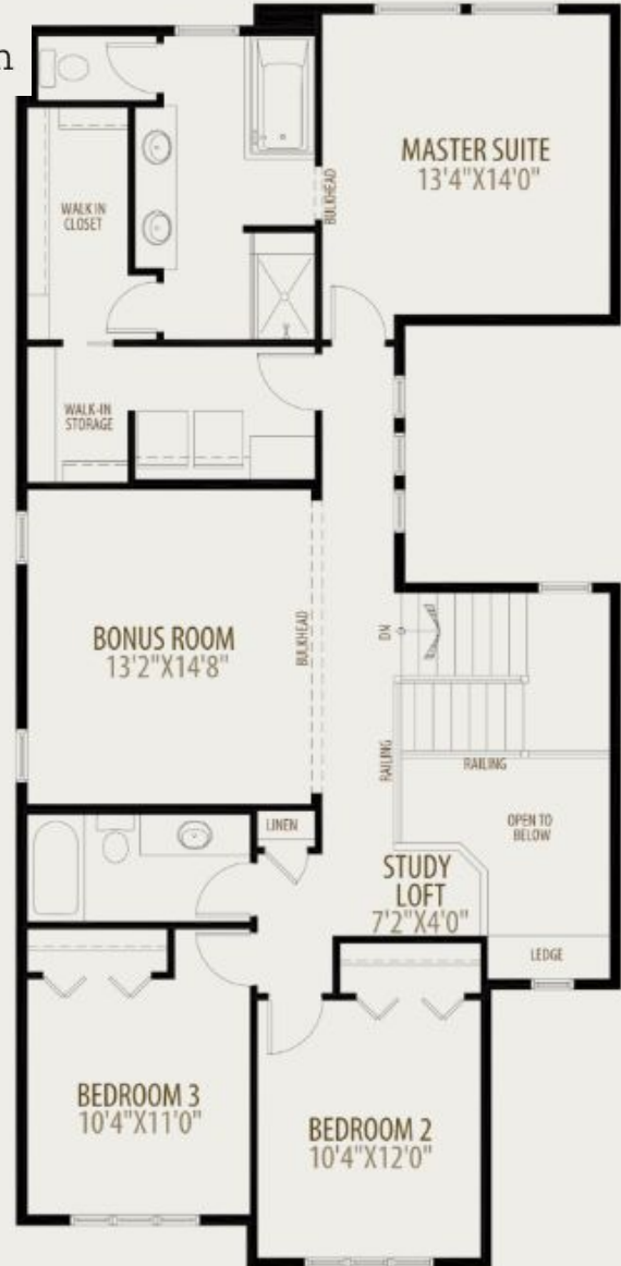
Upper Floor 1,338 sq ft