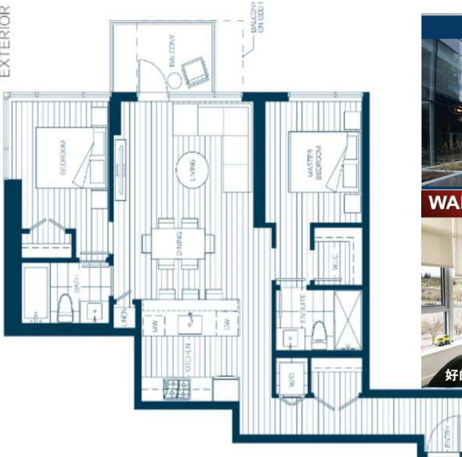
118 WATERFRONT COURT SW