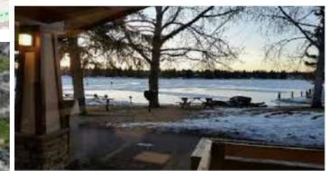
Midnapore Lake Residents Association ...