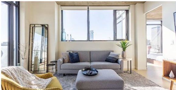
Living area with Mountain Views