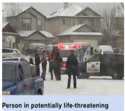
condition after landlord-tenant dispute...