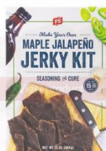
Jerky Kit - Maple Jalapeno