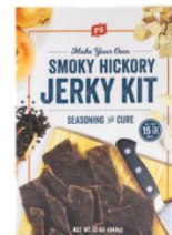
Jerky Kit - Hickory