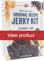
Jerky Kit - Original Recipe