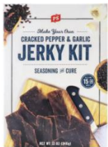
Jerky Kit - Cracked Pepper & Garlic

Jerky: Try our CUSTOM BLEND or one of the following seasoning options.