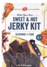
Jerky Kit - Sweet & Hot