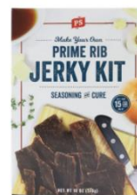
Jerky Kit - Buttery Prime Rib