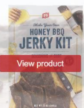
Jerky Kit - Honey BBQ