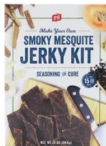
Jerky Kit - Mesquite