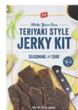
Jerky Kit - Teriyaki