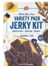
Jerky Kit - Variety