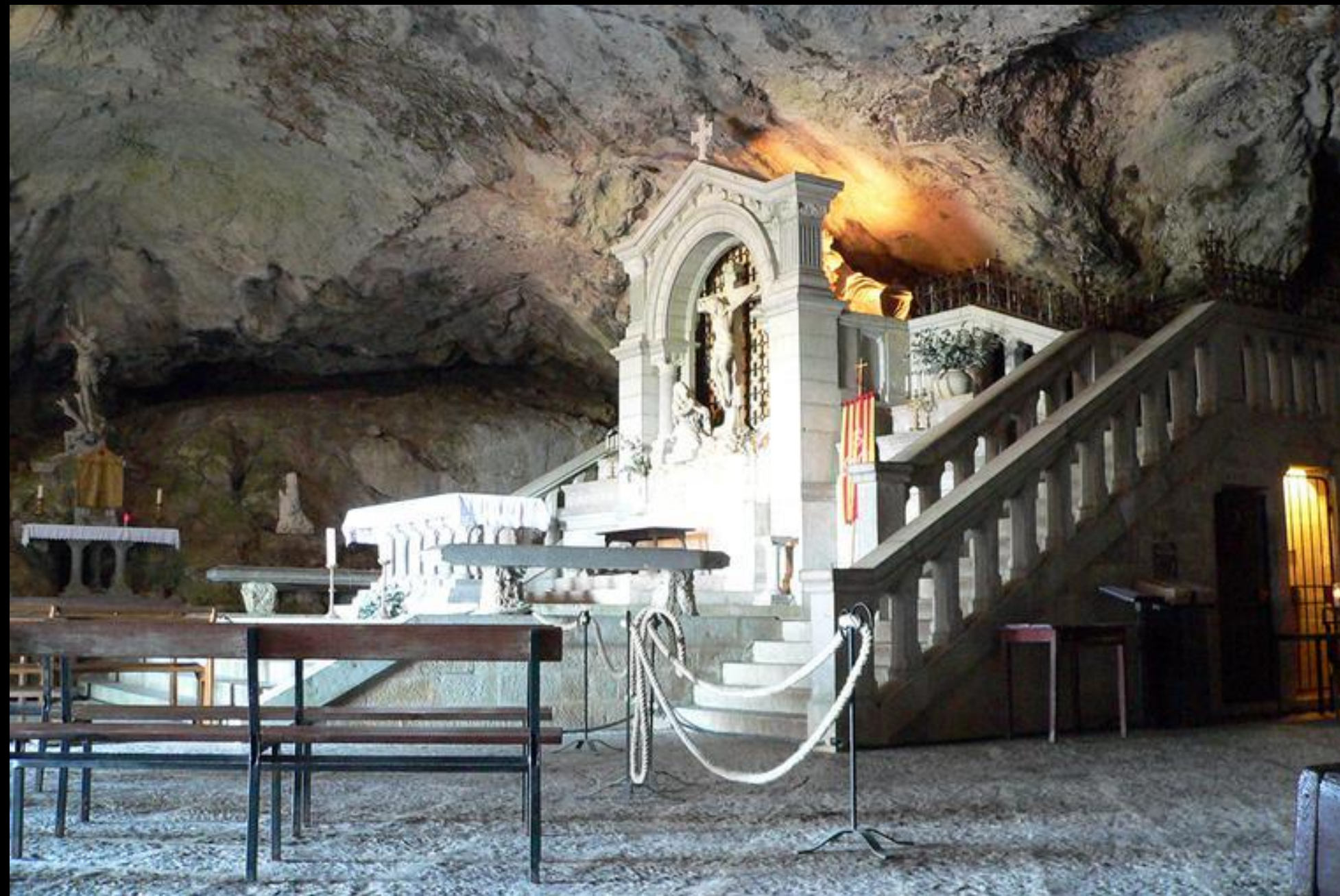
The Grotto in Saint Baume