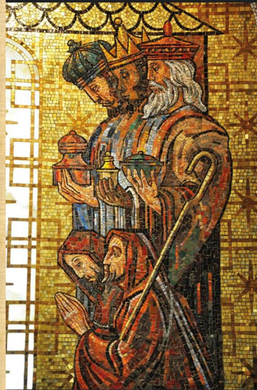
Basilica of National Shrine, Nativity Chapel Washington D.C

https://www.cloisterseminars.org/blog/2021/1/2/epiphany-eve-wise-women-also-came