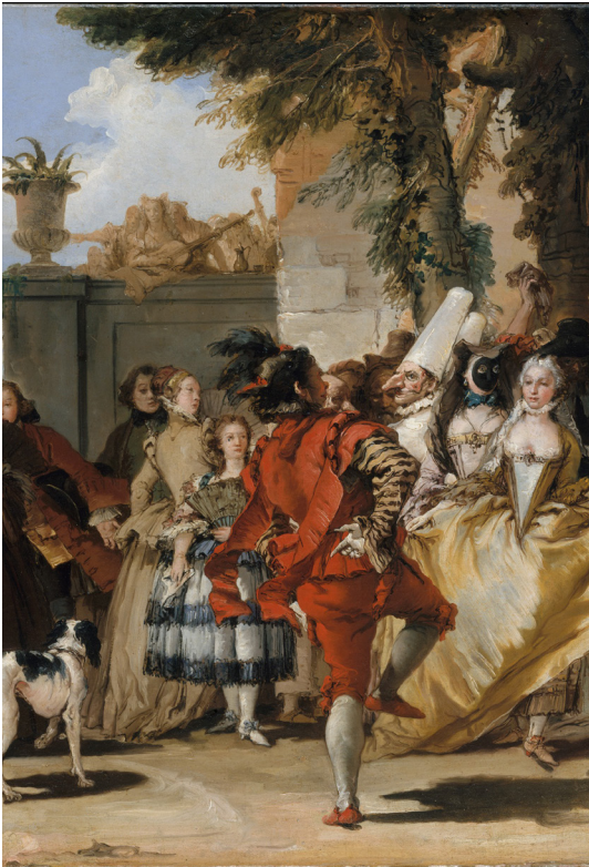
Tiepolo Carnival in Venice