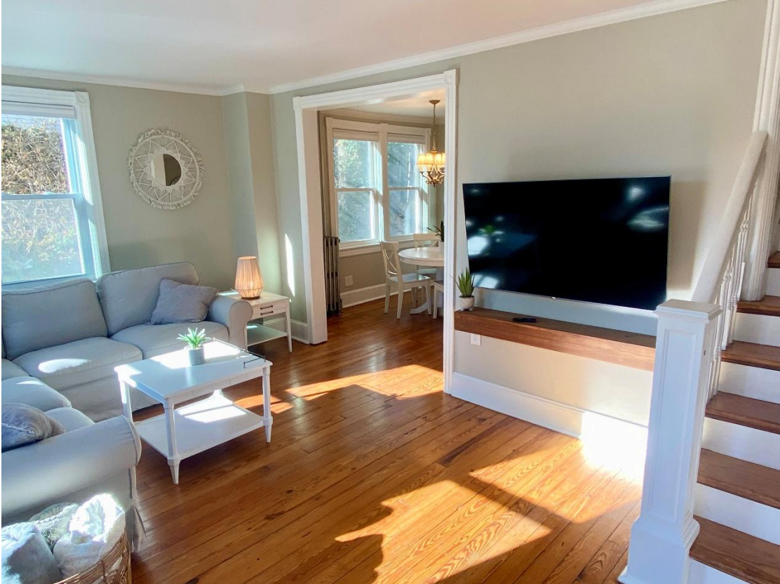
Living room with plenty of natural light, large couch, and TV.