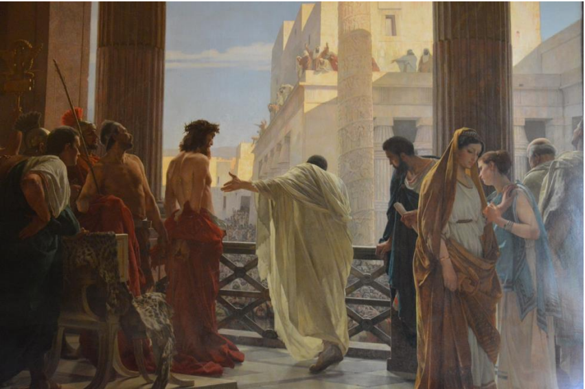
Antonio Ciseri: Ecce Homo, 1862

St. Paul's Lutheran Church 901 Cornwall Crescent Dawson Creek, BC