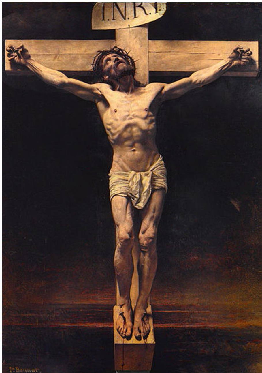
Léon Bonnat: Christ on the Cross circa 1874