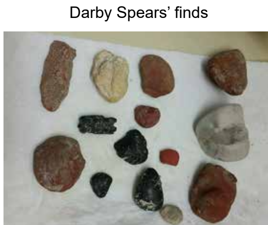
Darby Spears' finds