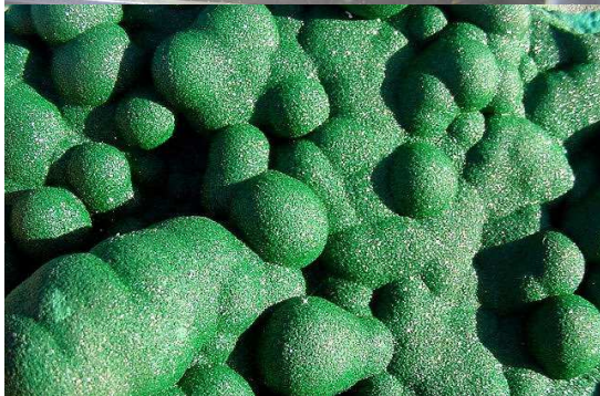
Several polymorphic forms of Malachite.