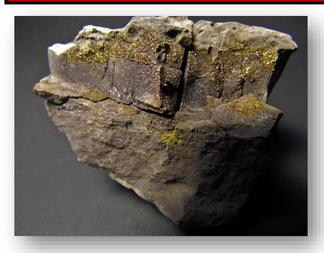
Chalcopyrite from this location.

PAGE 8 ROCK-N-ROSE TYLER, TEXAS JANUARY 2018