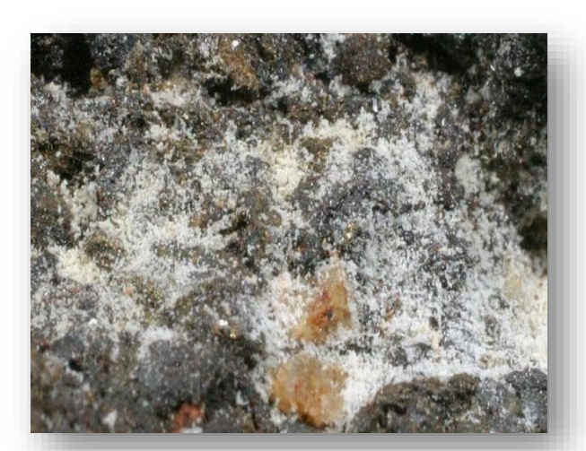
Crust of tiny Halotrichite "hairs" on rock.

The author made many weekend trips to that road cut when the heavy machinery was not working to collect petrified wood and several very unusual mineral species for this part of the country including quartz crystals with carbon inclusions, halotrichite, sulfur, pyrite and chalcopyrite. About halfway up the cut, a thin seam of very fine-grained siltstone was exposed that contained shrinkage cracks lined with tiny tetrahedrons of chalcopyrite sparkling in a rainbow of color. They were deposited as copper-rich water permeated the cracks and combined with the free sulfur that leached out of the sulfur rich lignite. There have been a number of reports of high concentrations of copper sulfate in some water wells in Rusk and Nacogdoches counties that could explain the presence of copper. It combined with the iron from the limonite stringers that are shot all through the formation to form chalcopyrite, CuFeS<sub>2</sub>. The other "rare" mineral for East Texas was the presence of halotrichite, a hydrated iron, aluminum sulfate, FeAl<sub>2</sub>(SO<sub>4</sub>)<sub>4</sub>·22H<sub>2</sub>O. It was rarely seen, usually late in the day when there was no moisture, since even morning dew could dissolve it. It appeared as a white "fuzzy" efflorescence on the siltstone. Tiny well terminated quartz crystals lined cavities in the petrified wood and many had a sprinkling of cubes of pyrite, FeS<sub>2</sub>, on them. Here again, the iron coming from the limonite and sulfur