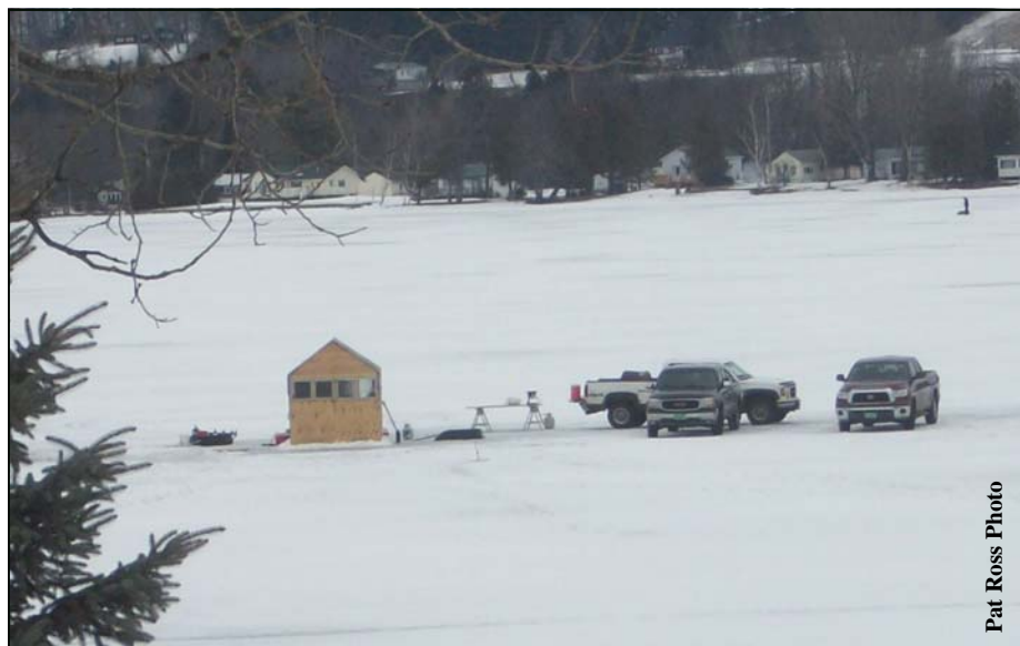
Winter ice fishing 2012 off the western shore of Salem Lake.

Smelt, perch, salmon and walleye were among the species of fish caught. A fishing committee will be revived, hopefully at the Annual Meeting this summer. One negative aspect was the wheeling and spinning of vehicles out on the ice at all hours of the night. Law enforcement was informed and will continue to be notified anytime something like this goes on.